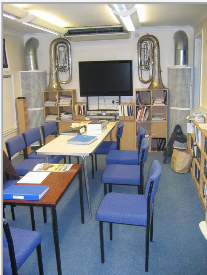
Heritage Centre 2007 (left) and 2023 (below) The current picture was taken on Saturday March 18th, 2023 and is fairly typical of the present day - apart from the infant's high chair. We welcome younger members but not so far this young! As it happens, Poppy's was hosting an event that day and needed to make space, while we were just dropping in.