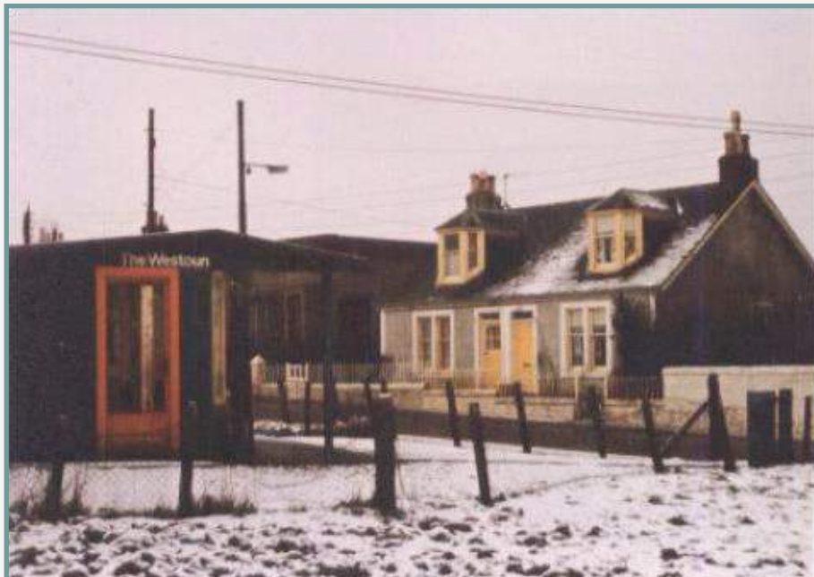
'The Westoun', Bellfield Road

Find us on Facebook: https://www.facebook.com/ groups/287186251435102